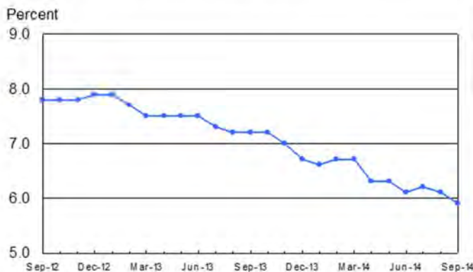
Chart 1. Unemployment rate, seasonally adjusted, September 2012 – September 2014